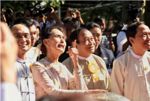
State Counsellor Daw Aung San Suu Kyi attends Medical Skill, Simulation and Research Center in Yangon