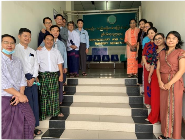
Figure 1. HBP family

It has been over 6 years that Hepato-biliary and Pancreatic Surgery Department (HBPS), Yangon Specialty Hospital (YSH) was founded. Amongst routine HBP surgeries and management for prevention and cure, currently there are two specific areas that we have been trying to establish and become international. These are Liver Transplantation (both DDLT and LDLT) and Laparoscopic HBP surgery.