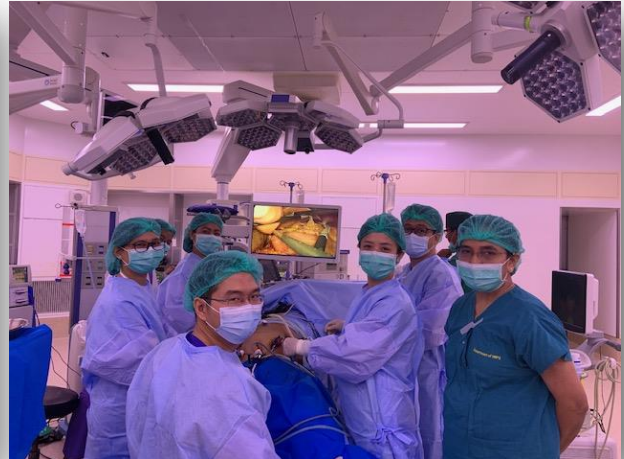
Figure 11 and 12. Applying in laparoscopic surgery

In conclusion, the door of opportunity is wide open if you are prepared (Unknown) and success occurs when opportunity meets preparation (Unknown). By mean of these efforts, we hope that we could establish the liver transplantation and laparoscopic liver surgery routinely in near future.