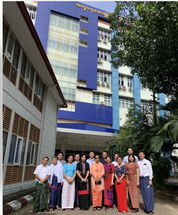
Figure 2. HBP family

We have been making dots like Korea-Myanmar transplant collaboration, multidisciplinary group training or fellow training to high volume centers. Moreover, doing practices in silent mentor or animal workshops are steps to get to our destination.