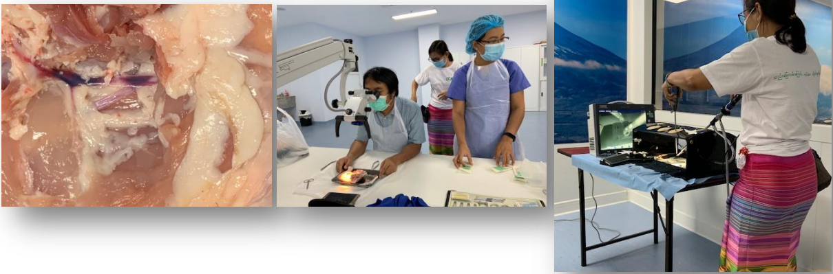
Figure 6,7 and 8. Practices in Medical Skill, Simulation and Research Center

As cumulative outcomes of these practices, previous fellow trainings and live demonstrations, we can extend our operative criteria in cholangio-carcinoma and perform laparoscopic HBP surgeries more confidently.