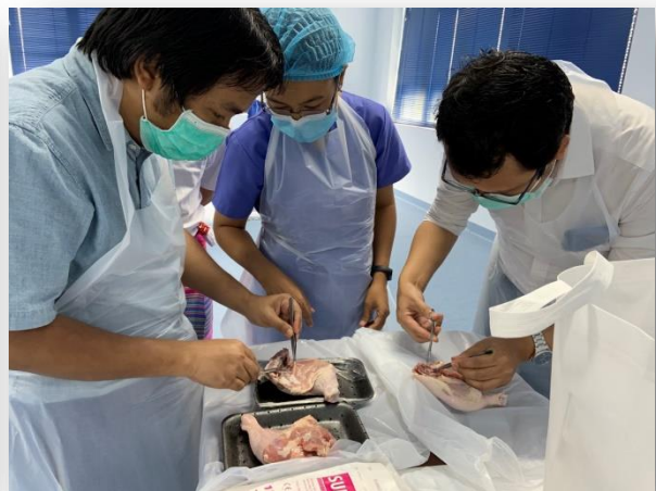
Figure 4 and 5. Practices in Medicak Skill, Simulation and Research Center